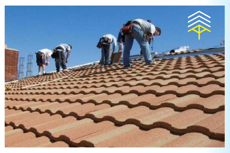
MANGLORE TILE ROOFING WATERPROOFING